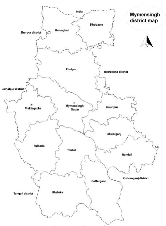
Figure 1. Map of Mymensingh district, showing the study sites, Mymensingh sadar and Muktagacha upazila

The study was undertaken in Mymensingh sadar and Muktagacha upazilas of Mymensigh district during the period of July to December, 2016 ( Figure 1 ).